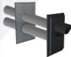
Twin Pipe Horizontal Termination