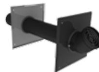
Single Horizontal Termination