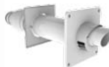
Horizontal Concentric Termination