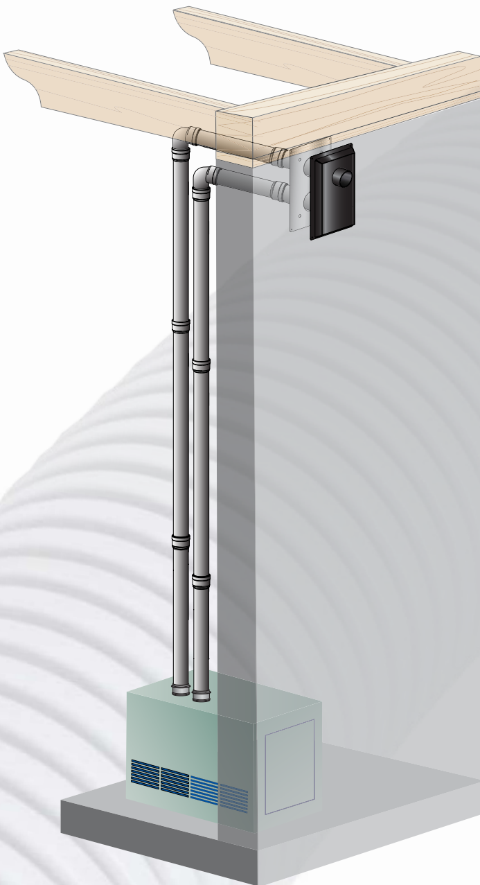
Poly Pro ® Twin Pipe Horizontal Termination below grade installation