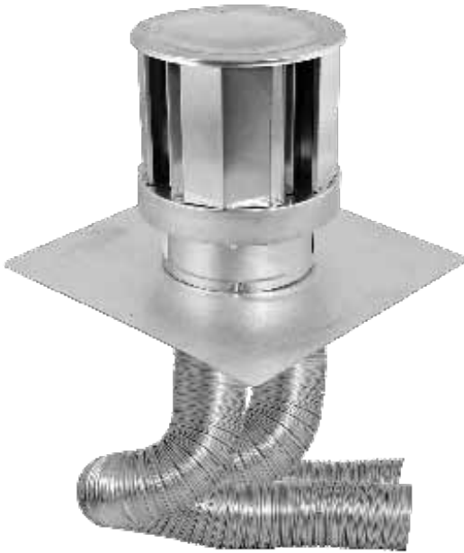
High Wind Cap